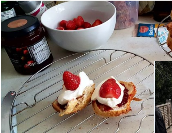
Templar Road joined in with the festivities too