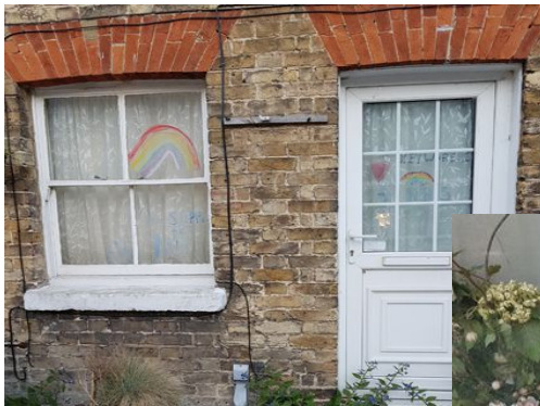
Some colourful images