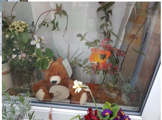
From around the village