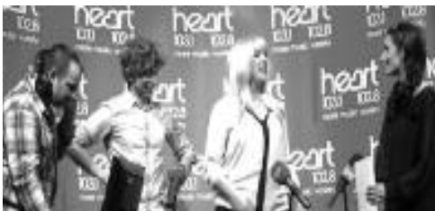
Players at The Marlowe